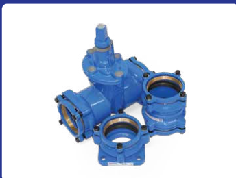
PE DI FITTINGS